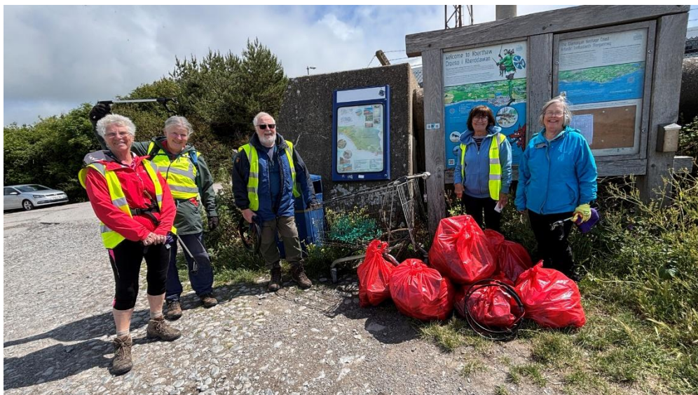
Porto Due summer meal and Gileston Litter Pick