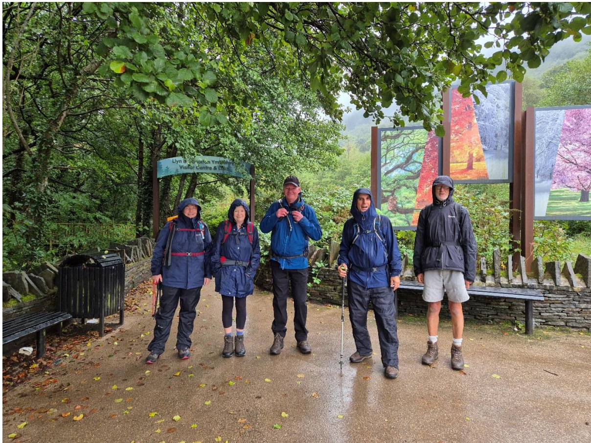
Kim's Twmbarlwm Walk