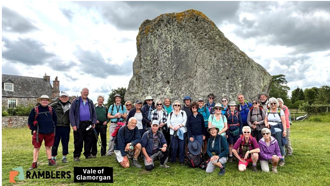
Avebury Stone Circle