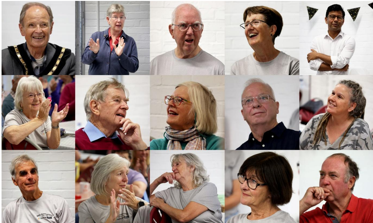
Our guests and members