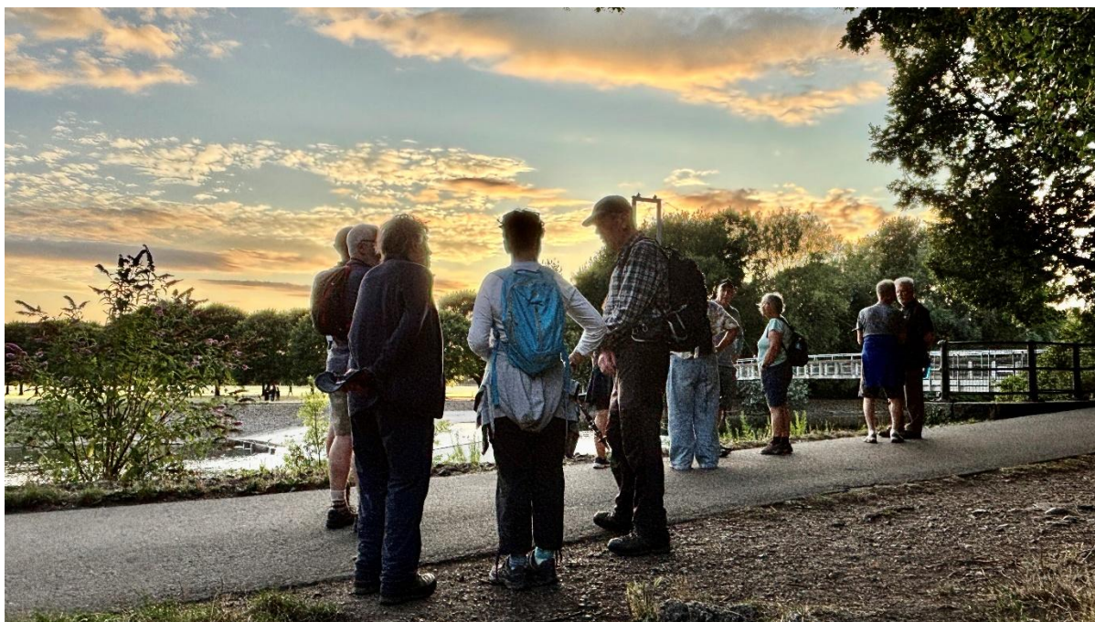
Black Weir Cardiff